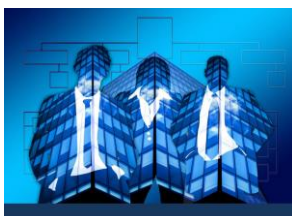
The Envisioning Report for Empowering Universities 1 st edition

We are proud to announce the first Envisioning Report for Empowering Universities in the uptake of new modes of teaching and learning.