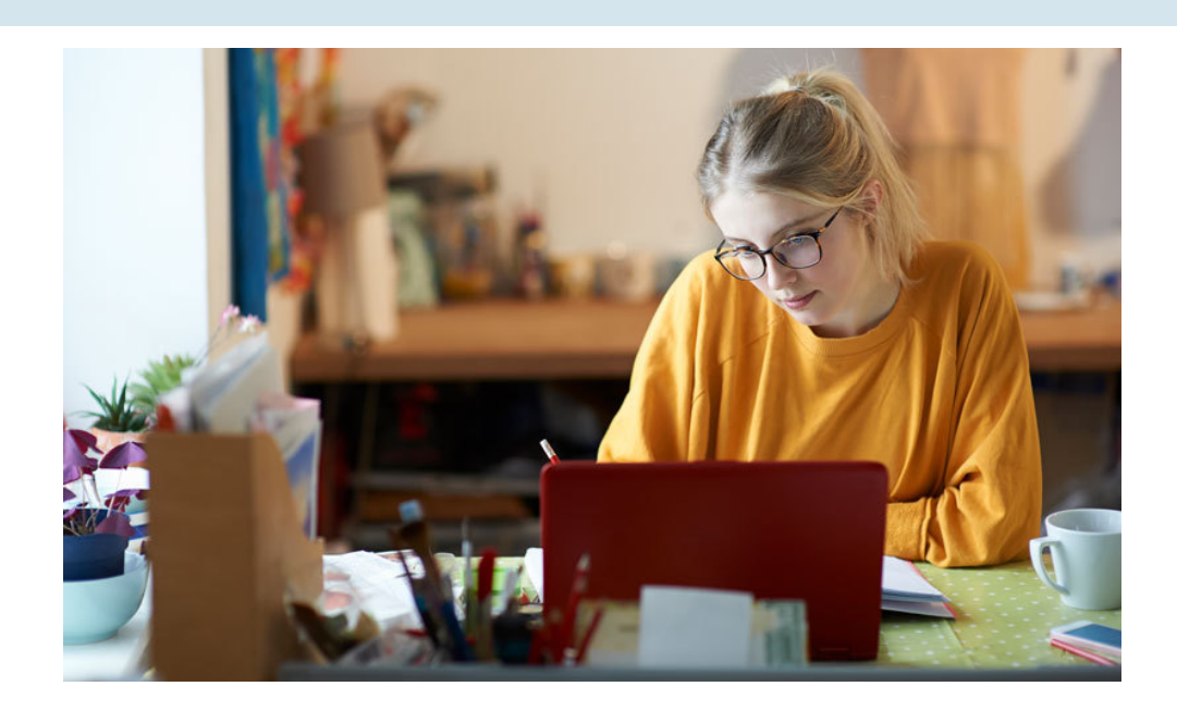
FernUniversität successful in international digital academic collaboration funding bid

The German Academic Exchange Service (DAAD) is funding four international digital teaching projects at the FernUniversität in Hagen, which makes it the best-represented German higher education institution in this 5.5 Mio Euro program that is funding 41 institutions in total. It was created to promote virtual mobility and collaboration in order to address the challenges of the global pandemic and to ensure an international dimension in blended study programs at German universities. The FernUni projects are integrated into Master programs in Educational Sciences, History, Law, and Informatics. They use various approaches of international collaboration, such as blended international mobility, collaboration within a virtual lab and joint creation of educational products.