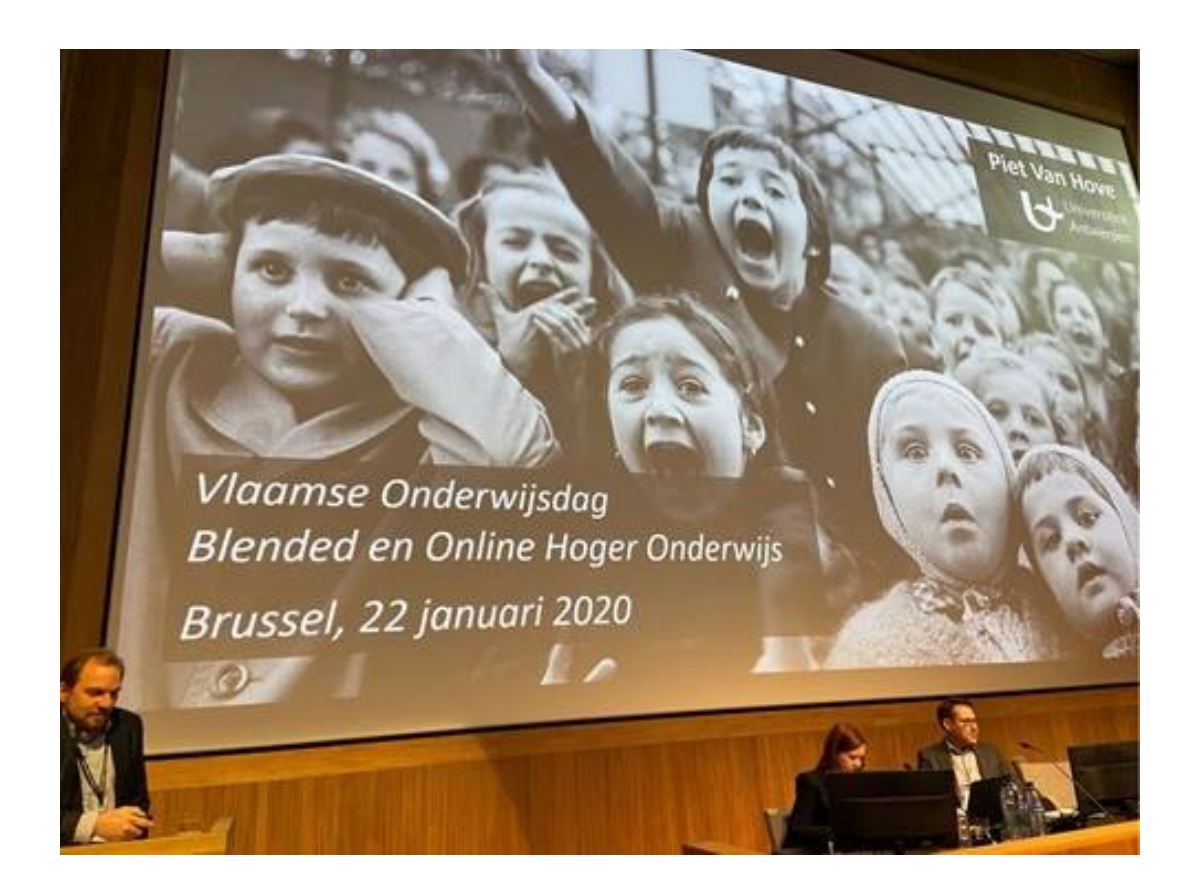
Flemish Education Day on blended and online higher education

During the Flemish Education Day, which took place in Brussels on January 22, 2020, large space was given to EADTU's multiplier event "EMBED" on the development of a European Maturity Model for Blended Education.